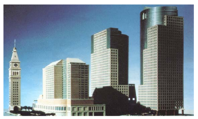
Original Project Model